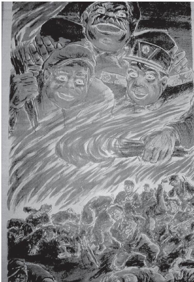
A leaflet distributed in Korea during the war. The figures at the top represent Mao Zedong, Stalin and Kim Il-sung. Kim Il-sung was the Prime Minister of North Korea.