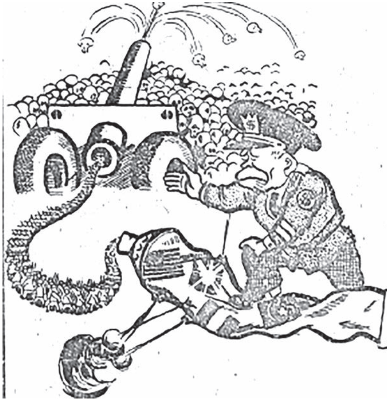
A leaflet distributed in Korea during the war. It shows UN troops being squeezed out of a toothpaste tube and into a cannon where they are fired northward.